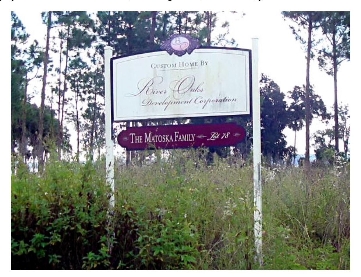
387. For example, in Liberty Bluff, James Matoska purchased, through a company he formed called Red Earth, Inc., Lot 91. He purchased the lot on or about August 23, 2002 for $49,600, and then later sold it for $119,000. Wheeler purchased Lot 119, Liberty Bluff for $55,200 on or about September 13, 2002, and then later sold it for $118,900. Greene purchased Lot 125, Liberty Bluff, for $67,000, and then later sold it for $130,000. Greene also purchased Lot 81, Bella Collina. James Matoska also purchased Lot 364, Bella Collina.

386. ESI Living's principals—James Matoska, Wheeler, Greene and Pinter—and/or their families received numerous kickbacks from Ginn; they were permitted to purchase properties at substantial "discounts," including Lot 78, Bella Collina, pictured below: